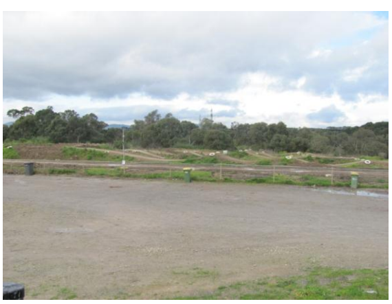
In the late 1990's 'leachate' was identified emanating from the former landfill site at 636-650 Burwood Highway, Vermont South